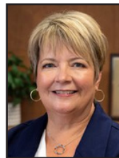
Judge Janet Protasiewicz

Both candidates will discuss their views on the race, their goals for running for Wisconsin Supreme Court and why they would like your support in the February Supreme Court Primary.