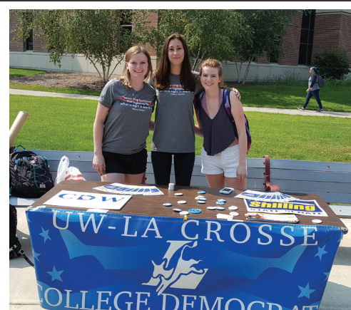
College Dems hard at work recruiting new Party members.