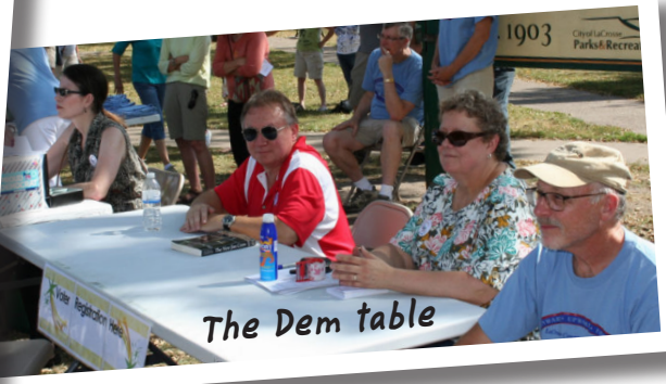
The Dem table