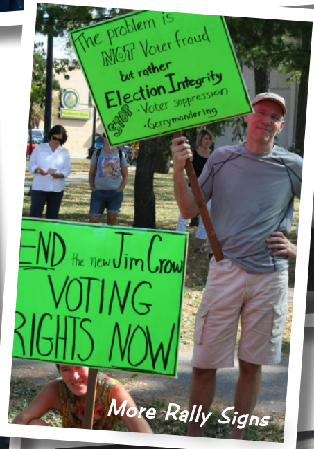
More Rally Signs