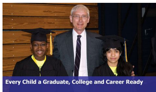
WI Superintendent Tony Evers