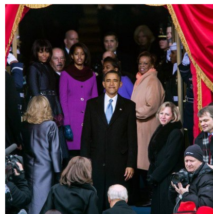
"One last look..."

The School Administrators Alliance is an alliance of Association of Wisconsin School Administrators (AWSA), Wisconsin Association of School Business Officials (WASBO), Wisconsin Association of School District Administrators (WASDA), and Wisconsin Council of Administrators of Special Services (WCASS). The SAA advocates on behalf of school leaders in their efforts to strengthen Wisconsin's national leadership in education to ensure that Wisconsin's children receive the highest quality education possible.